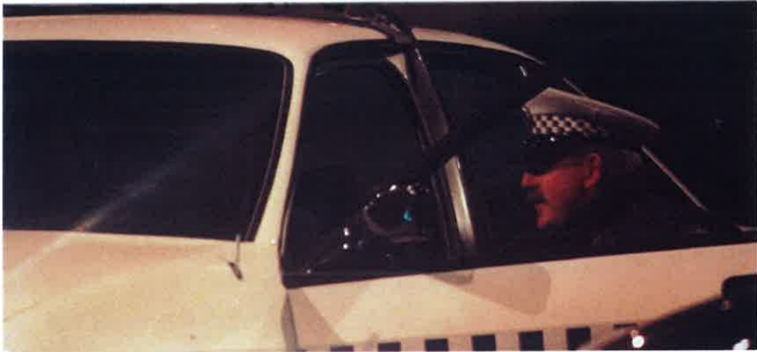
Police near the scene on Warrigal Rd.