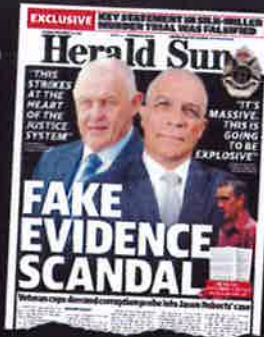
HERALD SUN, NOVEMBER 21, 2017