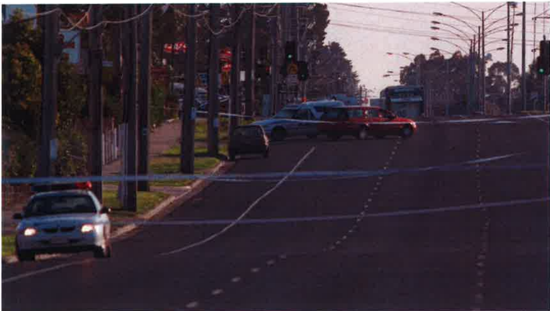
The scene of the murder.